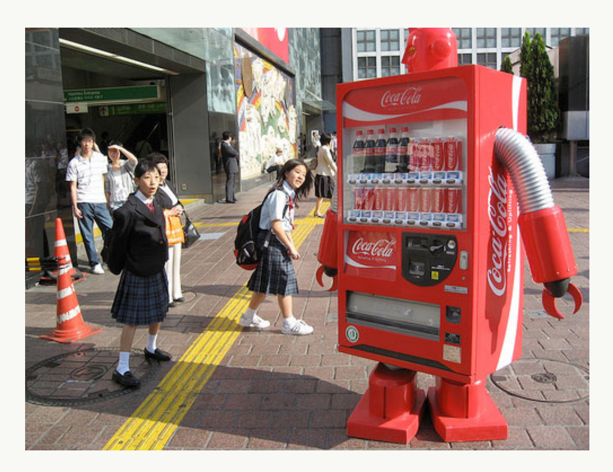
Thinking outside the box!!

That being said, it helps to have the capital to do something like this but with a bit of willingness and a lot of creativity anything is possible.