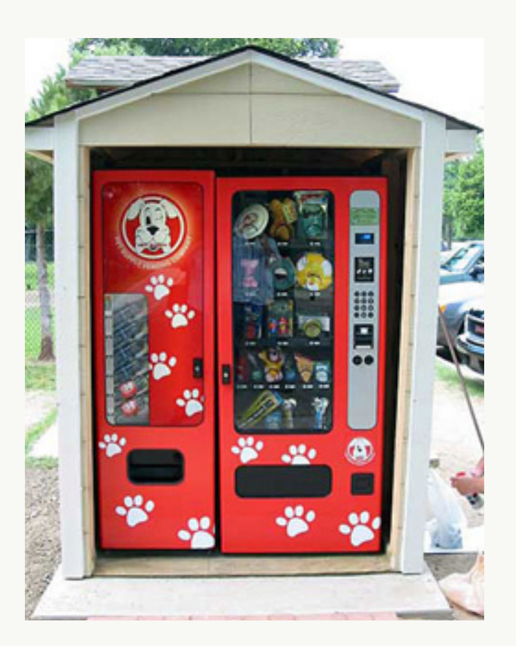
Product Specific Categories. Understanding the needs of a specific market.

Product specific category which Mile High Baby falls under. They have a true understanding for the needs of a specific market and bring products that fulfill the category.