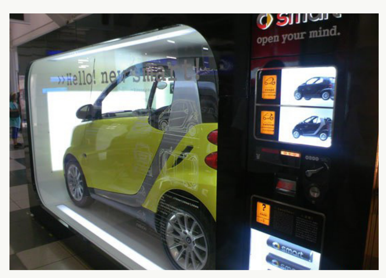
An eye catching and memorable piece of marketing. The Smart Car.

Despite this early precedent, vending machines had to wait for the Industrial Age before they came to prominence. The first modern coin-operated vending machines were introduced in London, England in the early 1880s, dispensing post cards. The first vending machine in the U.S. was built in 1888 by the Thomas Adams Gum Company, selling gum on train platforms. The idea of adding simple games to these machines as a further incentive to buy came in 1897 when the Pulver Manufacturing Company added small figures which would move around whenever somebody bought some gum from their machines. This simple idea spawned a whole new type of mechanical device known as the "trade stimulators". The birth of slot machines and pinball is ultimately rooted in these early devices.